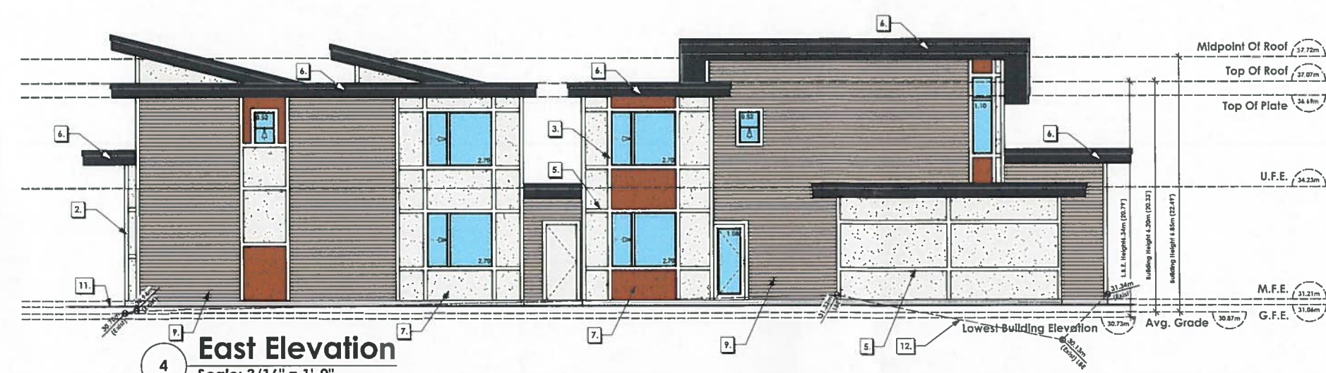
4 East Elevation Scale: 3/16" = 1'-0"