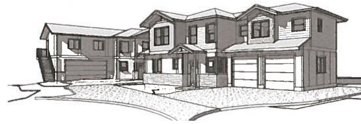
② 3D View 1

max permitted single family dwelling 7.5m (24.6') Proposed: from natural AV'G GRADE 6.73 m from natural L.A.G 6.91 m